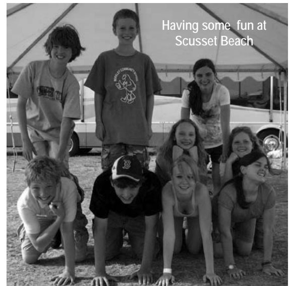
Having some fun at Scusset Beach