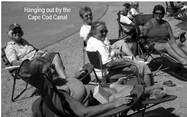
Hanging out by the Cape Cod Canal

PLEASE NOTE: All applications & renewals after Labor Day Weekend should be mailed to Beth King, 57 Trowbridge Circle, Stoughton MA 02072