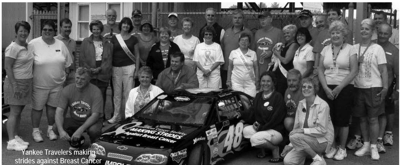
Yankee Travelers making strides against Breast Cancer